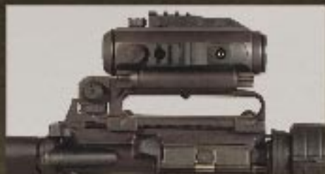
p/n ATOS3.0A with Handle Mount

Magnification 3.1x nominal Length 135mm nominal Width 65mm nominal with bumpers Height 77mm nominal with bumpers Weight 415g nominal Illumination source Battery-powered LED Illumination settings 11 visible, 3 night vision Reticle Dual-thickness crosshair with Rapid Aiming Feature and range finder