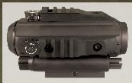
p/n ATOS3.0B2 'Marksman' Model

Eye Relief 66mm Field of View 6 degrees Exit Pupil 8mm Fixed Focus Range 20m to infinity Battery Type CR 123 (3v Lithium) Battery Life 3.1 years average Exterior Finish Black anodized aluminum Ballistic calibration