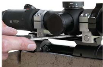
Use of an adjustable set of feeler gauges between a one-piece base and flat bottom section of the riflescope to square the riflescope (and reticle) to the base.