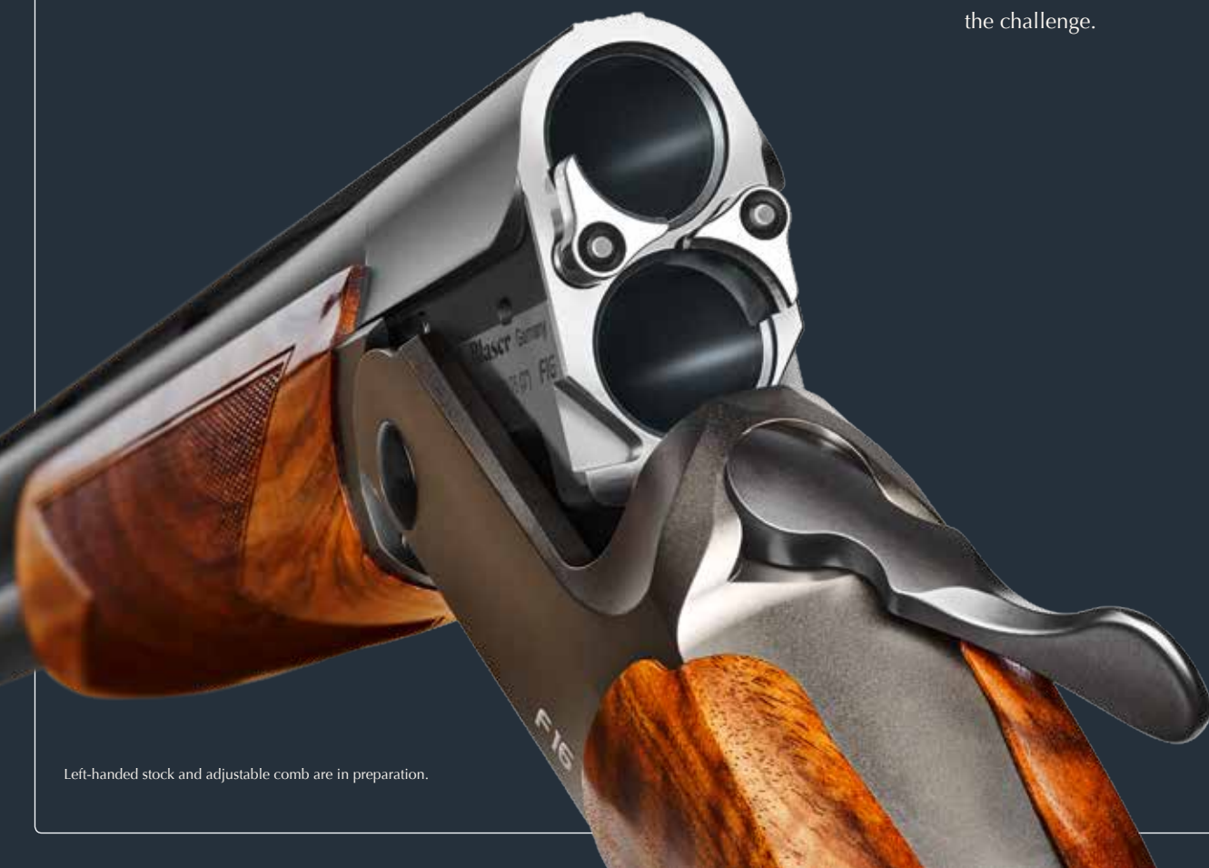
Left-handed stock and adjustable comb are in preparation.

The EBS® has another distinct advantage: shooter comfort is paramount so why would you want to force your gun closed to cock the ejectors? So relax shoot a Blaser and concentrate on what is really important, which is hitting the next target! Weather in the field or on the course the F16 is up to the challenge.