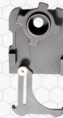
7035156 Samsung S3 stowable eyepiece mount