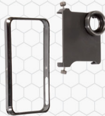
7035147 iPhone 4 & 4s ULTEM™ case