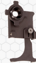
7035148 iPhone 4 & 4s stowable eyepiece mount