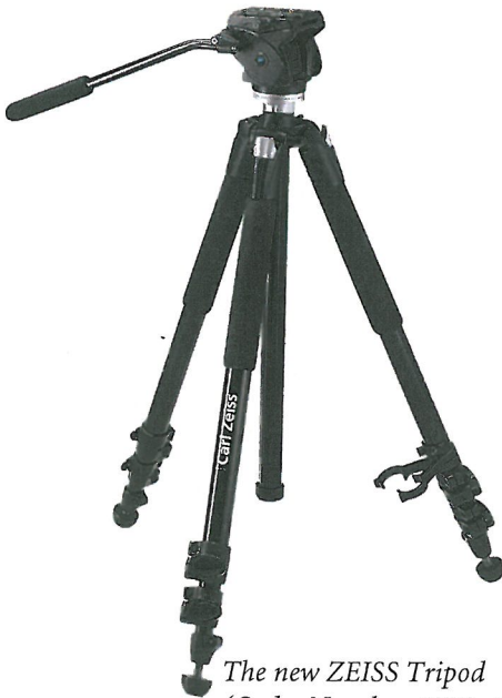
The new ZEISS Tripod (Order Number: 1778-480)

As of July 2010, Carl Zeiss offers a new aluminum tripod set with an updated and improved design. The new model marks the discontinuation of its predecessor (Model #1206-889).