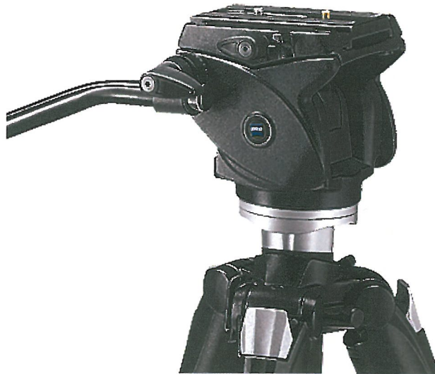
Improved Tripod Head