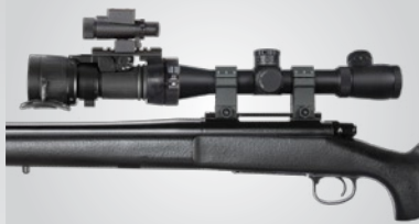
PS-40 INSTALLED ON DAYSCOPE OBJECTIVE LENS