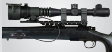
PS-40 INSTALLED ON MIL-STD-1913 RAIL FORWARD OF DAYSCOPE

The ATN PS40 is one of the most compact and lightweight NV systems in its class, at only 840 grams.