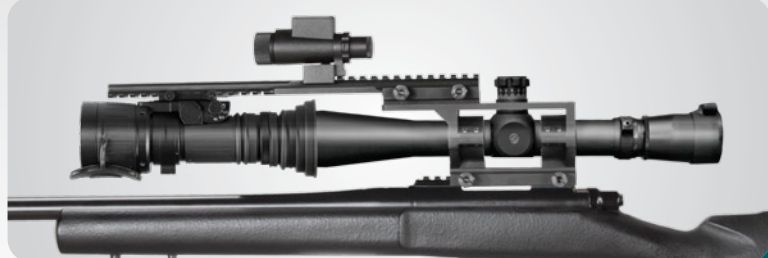
PS-40 INSTALLED ON B.A.M. system