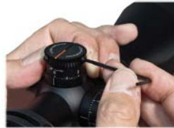
Align the elevation turret cap.

3. Re-tighten the retaining screws, but do not overtighten. Use of thumb and forefinger on the short end of the hex wrench will provide sufficient force.