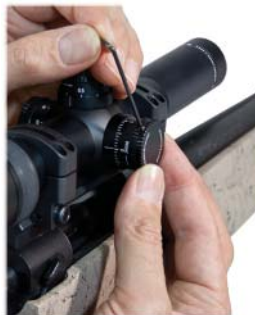
Align the windage turret cap.

Once the windage and elevation knobs are correctly indexed to the zero mark, temporary corrections can be safely dialed into the scope without worry of losing the original zero.