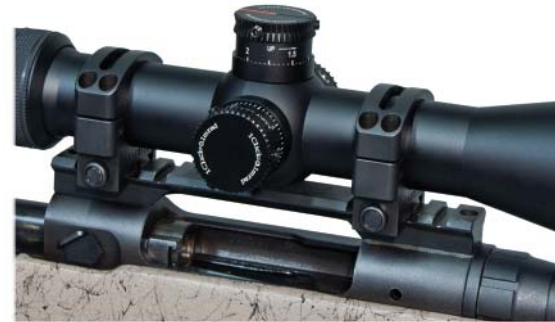
Use 30mm rings with the Viper PST.

Note: If the firearm is not already equipped with a Picatinny base, these are readily available for most rifles at larger firearms retailers.