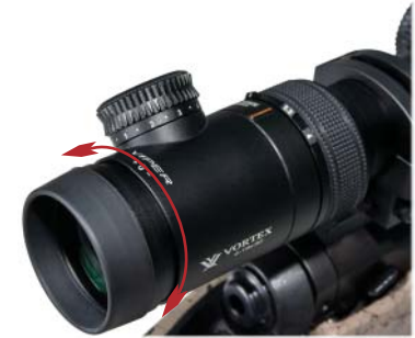
Adjust the reticle focus

Looking directly at the sun through a riflescope, or any optical instrument, can cause severe and permanent damage to your eyesight.